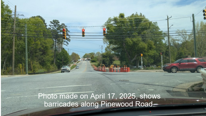
Photo made on April 17, 2025, shows barricades along Pinewood Road.