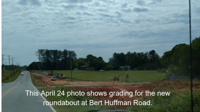
This April 24 photo shows grading for the new roundabout at Bert Huffman Road.