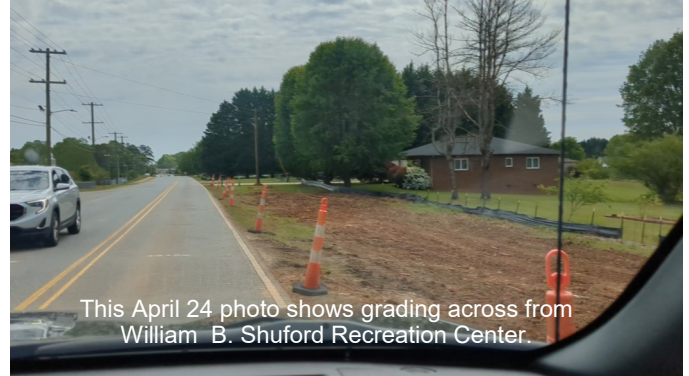
This April 24 photo shows grading across from William B. Shuford Recreation Center.