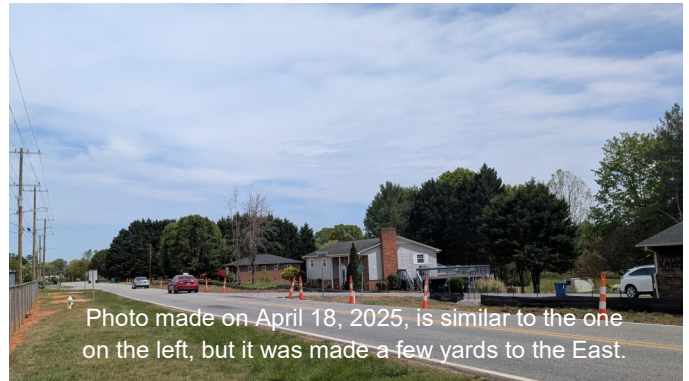
Photo made on April 18, 2025, is similar to the one on the left, but it was made a few yards to the East.