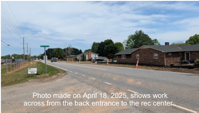
Photo made on April 18, 2025, shows work across from the back entrance to the rec center